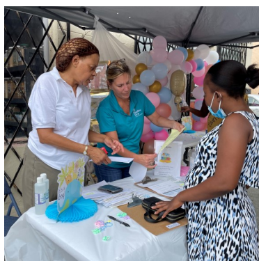
Families First Staff assisting mother-to-be at Baby Shower

Thank you to all the companies and individuals who participated in this year's "Blue April" to build awareness for Child Abuse Prevention Month. As a community we all can play a role in creating safe, healthy futures for our most important asset, our children. Please mark your calendars to wear blue in April 2023 so we can continue to expand this cause and work together to eliminate child abuse!