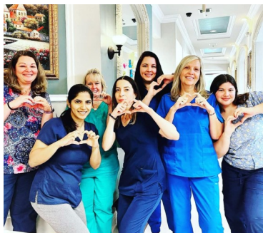
Staff from Integrity Dental of Wellington Wearing Blue