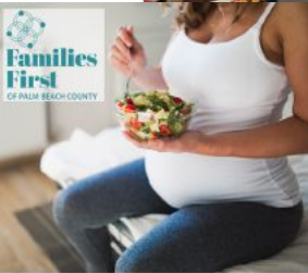
How important is eating healthy while pregnant?