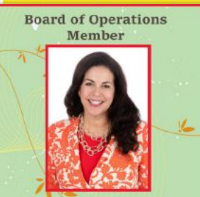
Board of Operations Member