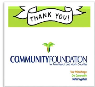
Families First is Awarded a Grant from CFPBMC