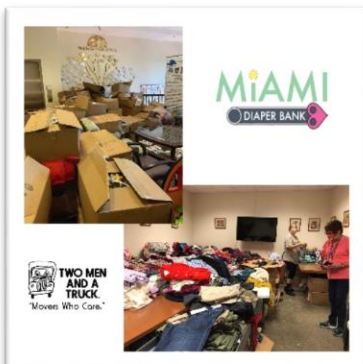
Miami Diaper Bank, Old Nay and Baby2Baby Donations