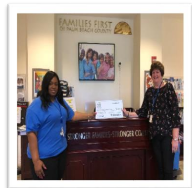
Honda Classic Cares supports our TOPWA Program