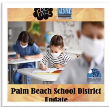
Families First Hosts District Update