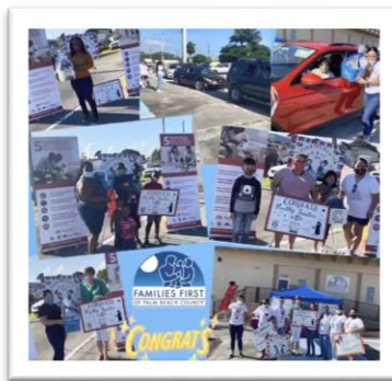
Healthy Families Graduation