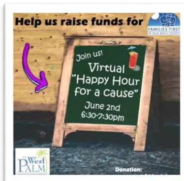
West Palm 100 hosts a Happy Hour for us!