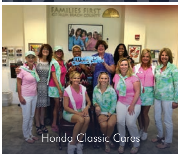
Honda Classic Cares