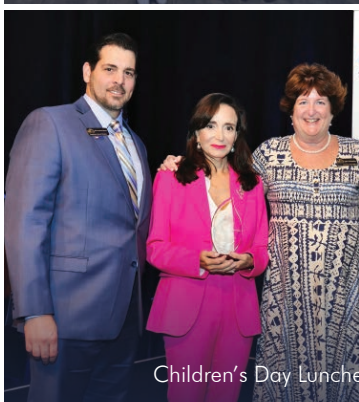
Children's Day Luncheon