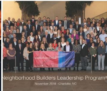
Neighborhood Builders Leadership Program® November 2018 - Charlotte, NC