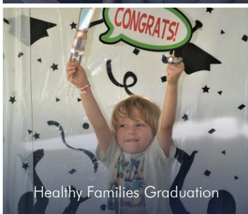
Healthy Families Graduation