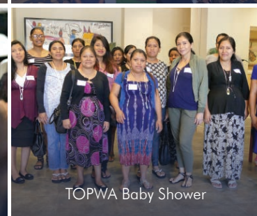
TOPWA Baby Shower