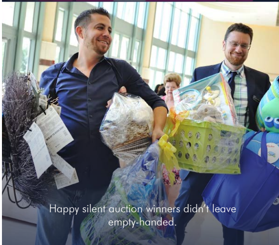
Happy silent auction winners didn't leave empty-handed.