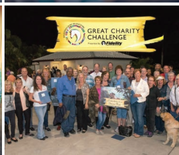
Great Charity Challenge