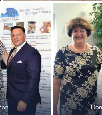
Donor Appreciation Breakfast