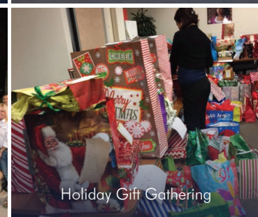
Holiday Gift Gathering