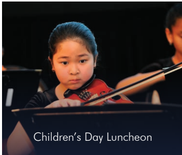
Children's Day Luncheon