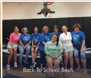
Back To School Bash