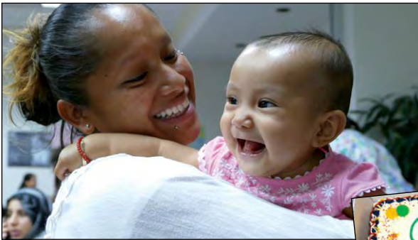
TOPWA Baby Shower Celebration