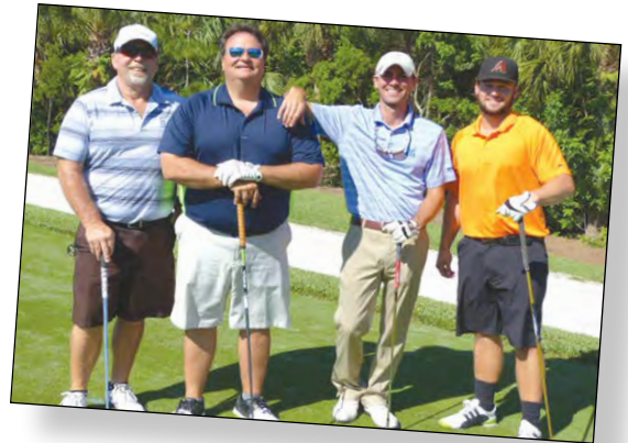
RMA Golf Tournament