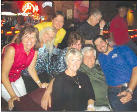
Spare Some for Charity RMA bowling event