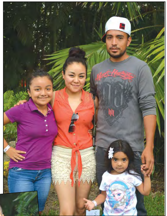
Healthy Families Graduation Celebration