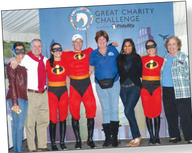
Great Charity Challenge