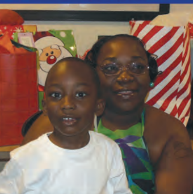
Holiday Gathering with Bridges to Success