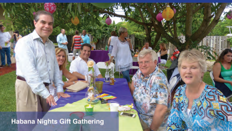
Habana Nights Gift Gathering