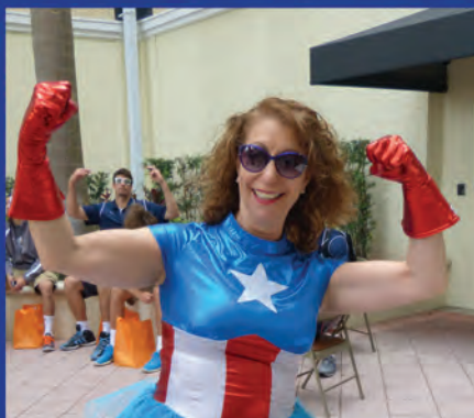
Superhero Scavenger Hunt