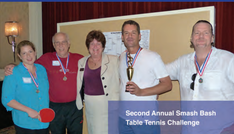
Second Annual Smash Bash Table Tennis Challenge