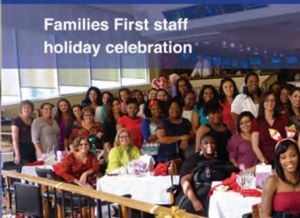
Families First staff holiday celebration