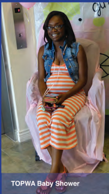
TOPWA Baby Shower