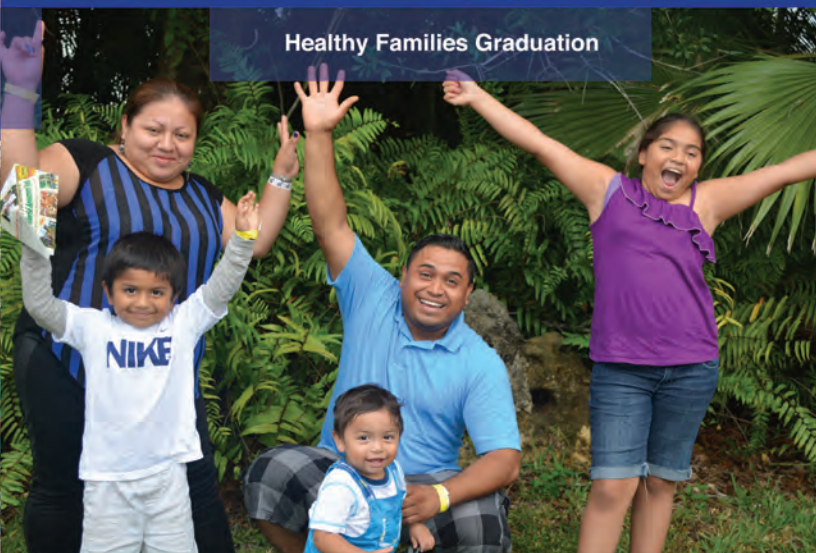
Healthy Families Graduation