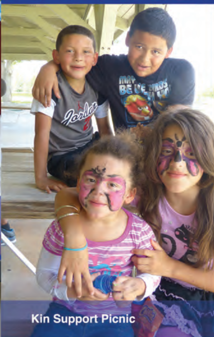
Kin Support Picnic